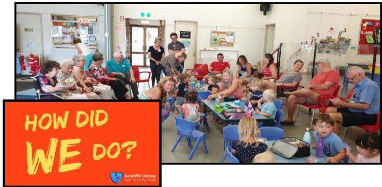
[Intergenerational Playgroup Day]