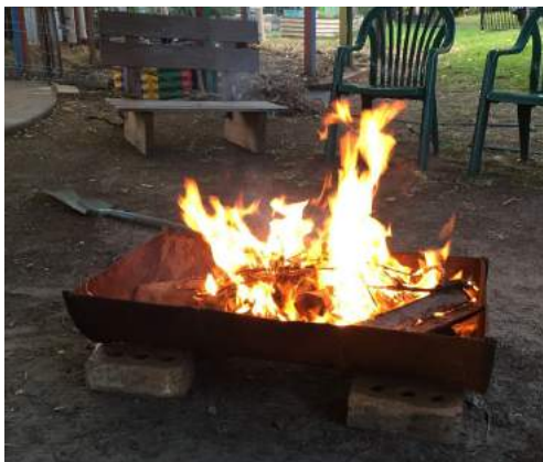
Left: Fire Pit night